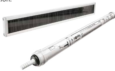
Rechargeable Battery & Solar Panel

Somfy® and Rollease Acmeda® automation systems are designed to improve your comfort, security and energy efficiency – making life easier. Our customer representatives throughout New Zealand as well as our Technical Services Manager, can consult with you or your architect at the planning stage for all domestic or commercial projects requiring automation.